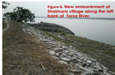
Figure 8. New embankment at Shalmara village along the left bank of Torsa River.