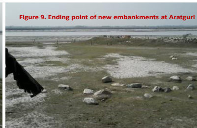
Figure 9. Ending point of new embankments at Aratguri